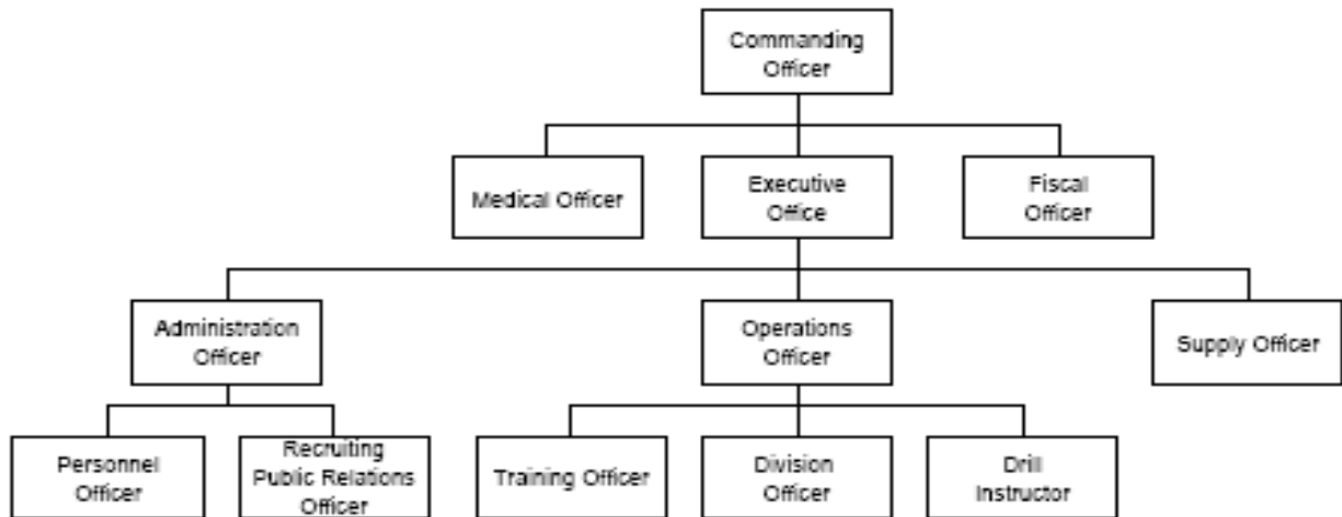
Figure 2. Officer Chain of Command